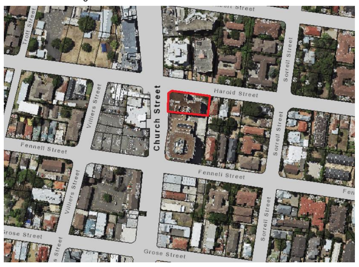
Figure 1: Location map

The subject site is located at 470 Church Street, Parramatta, refer to Figure 1. The legal description is Lot 1 DP 785930 and the site area is 1,629sqm. Currently the site contains a five storey commercial building with a medical centre on the ground floor.